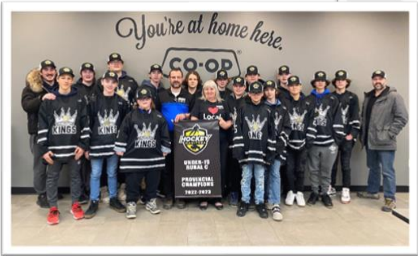
Dauphin Minor Hockey U15 Silver Team & Tournament Sponsor