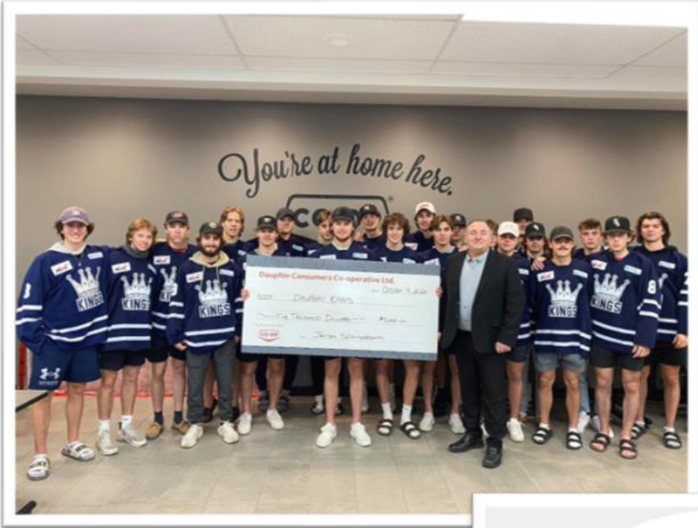
Dauphin Kings Jersey Sponsor Ag Appreciation Night Sponsor

Dauphin Co-op partnered with twelve MB Co-ops to make a bigger impact as Resilient Minds Sponsors for Manitoba Farmer Wellness Program. This program provides free and confidential counseling for farmers and their families when they need it most.