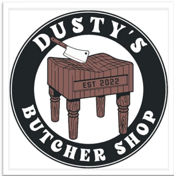
Dusty's Butcher Shop Dauphin MB

Sourcing local, Manitoba products is not limited to edible foods; we also source grain bins from Meridian Manufacturing, Winkler, MB, Koch Fertilizer in Brandon, MB, Brett Young Seeds in Winnipeg, and AGI in Winnipeg. Visit our website for a list of Manitoba companies that we work with.